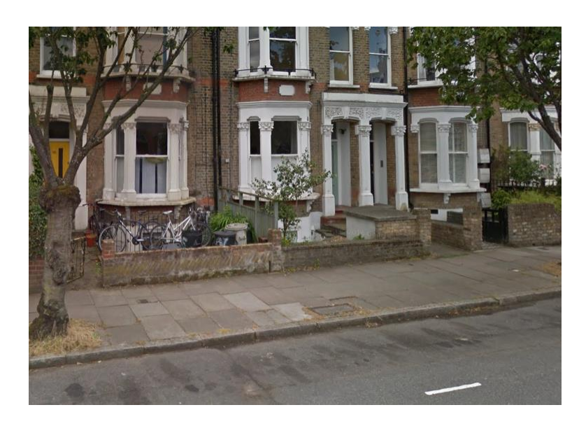
Image 3: Photograph Showing Other Examples of Lightwell Development at 88 and 90 Mercers Road